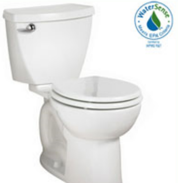
Cadet® 3 FloWise™ Round Front