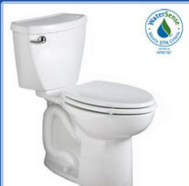
Cadet® 3 FloWise™ Elongated Front