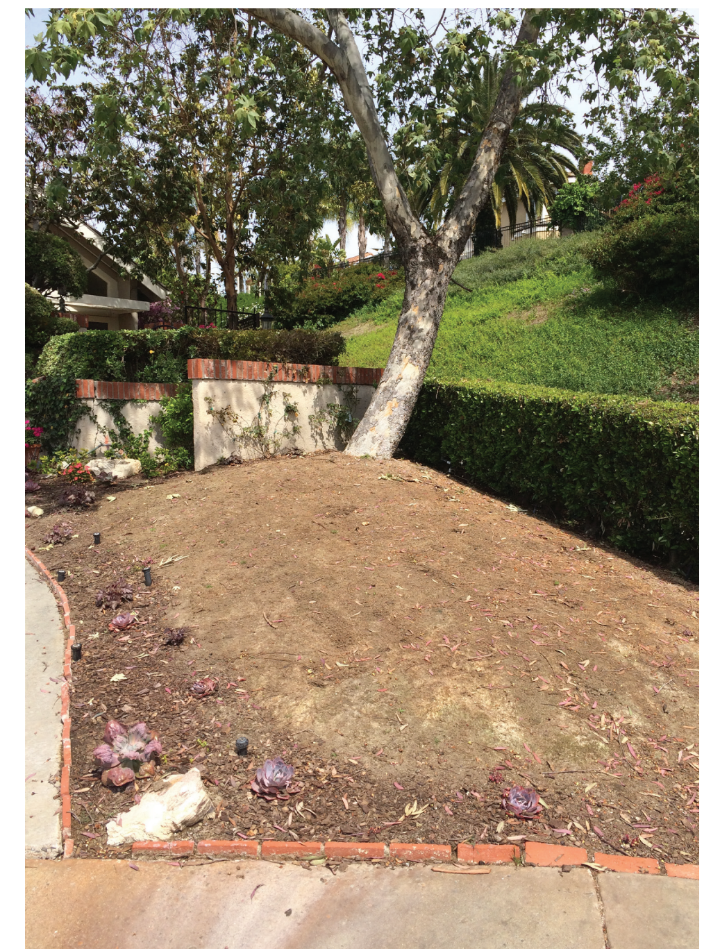
BEFORE Turf Removal Project