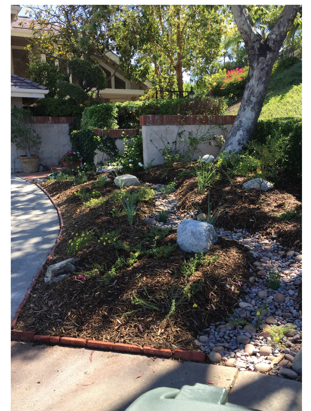
AFTER Turf Removal Project