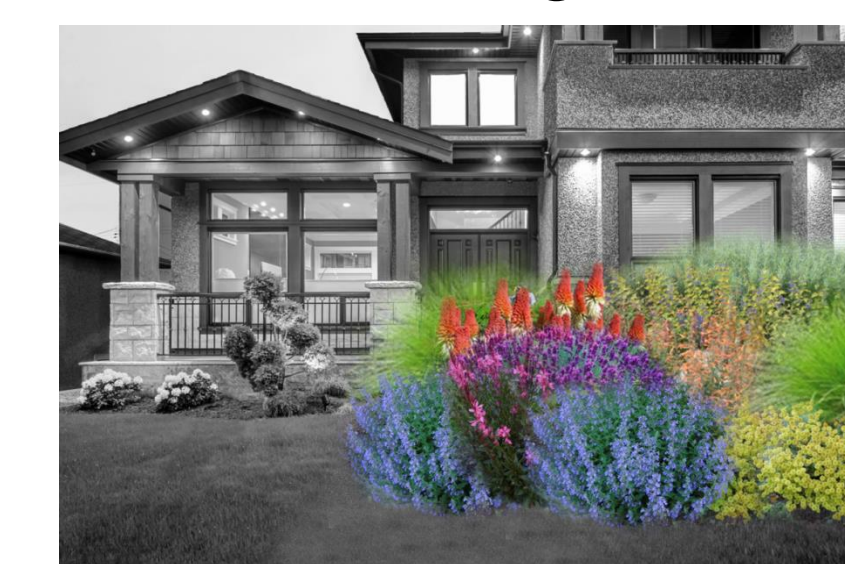
Artist rendering of an established garden