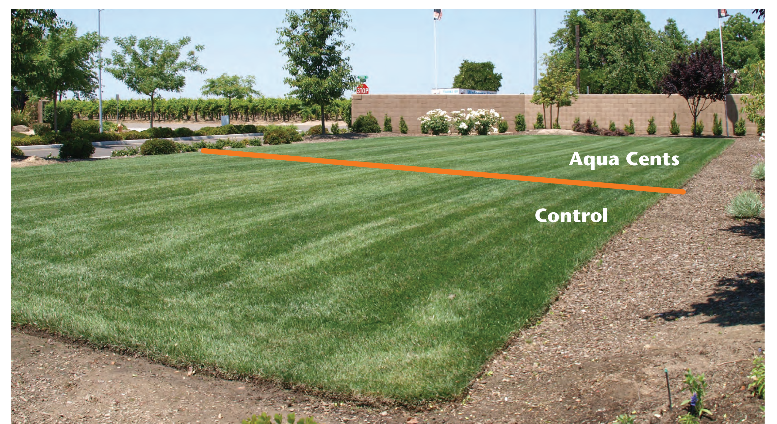
R. J. Hill Model Homes - Fowler, CA

45% Average Water Savings vs. Control Plot at 100% ETc