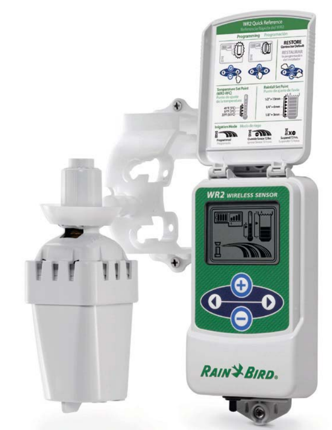
Wireless Rain/Freeze Sensor