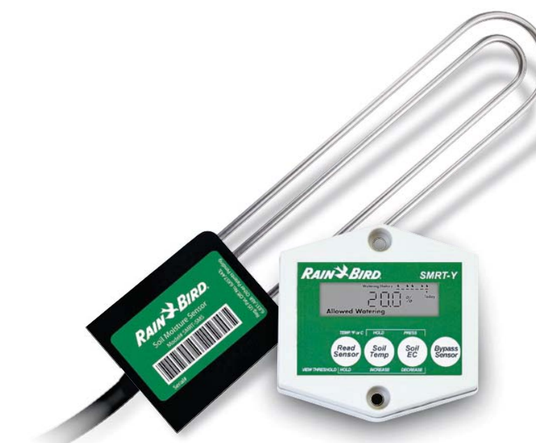
Soil Moisture Sensor