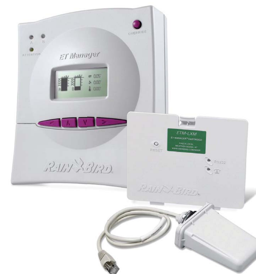
ET Based Controller Add-On