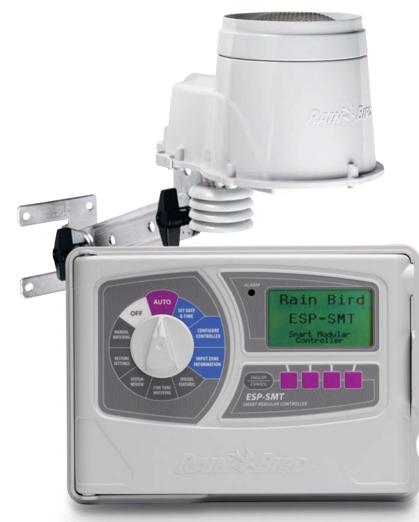
Residential Smart Controller