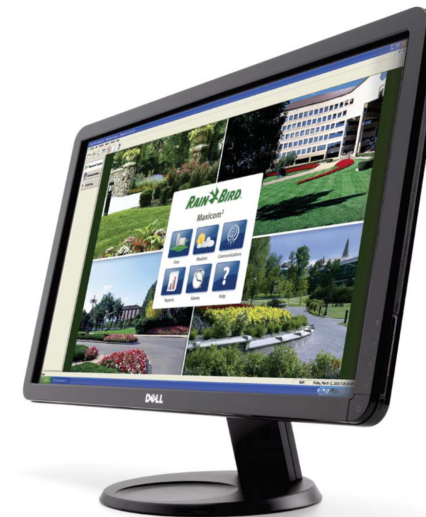
Central Control Systems